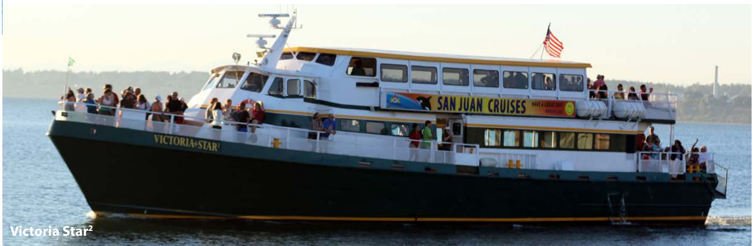
Victoria Star 2

Bellingham Bay, Chuckanut Bay, La Conner and the San Juan Islands